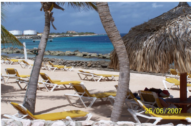
Plaza Beach 18 Palms