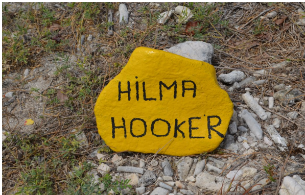
103 Dive Sites