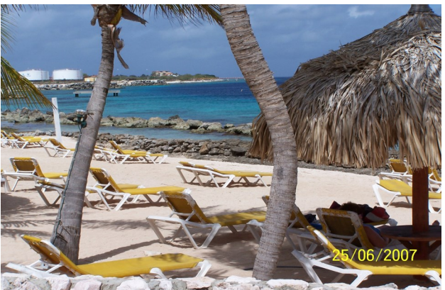
Plaza Beach 18 Palms