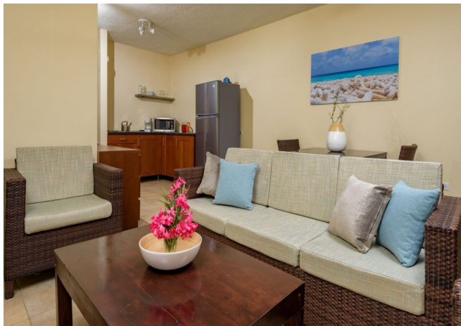
1 Bedroom Suite