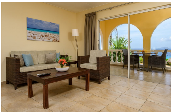
2 Bedroom Suite Living Room