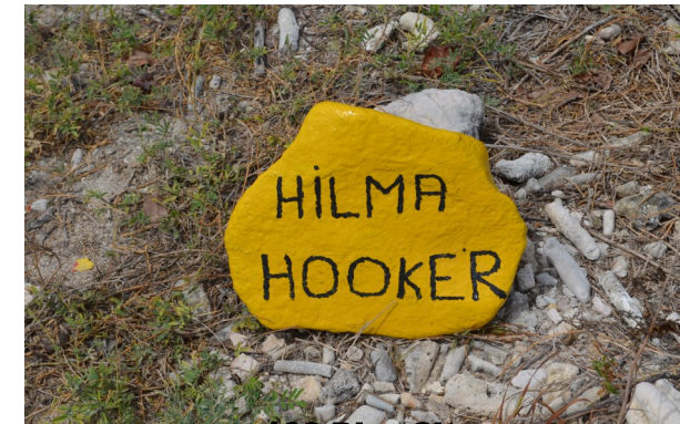
103 Dive Sites